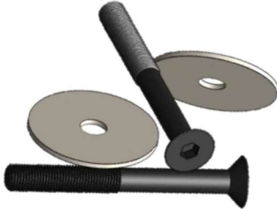
2019-present GM crew cab below back seat mounting hardware Part # 300.03