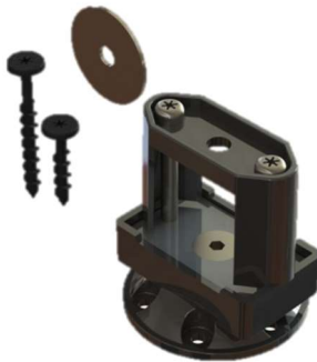
Additional clamp assembly w/hardware Part # 200.50