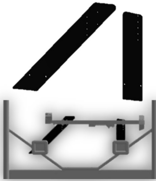
Can Am Defender (all years & models) rear headrest mounts Part # 200.41