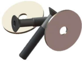
2015-present Ford crew cab below back seat mounting hardware Part # 300.04